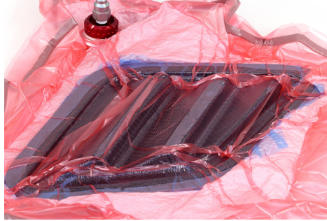
Once laminated, the part is vacuum bagged and cured in an oven at 120°C under vacuum.