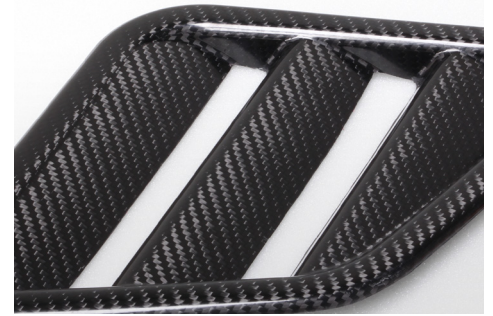
The cured part has a pin-hole free 'class A' surface finish straight from the mould.