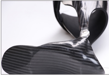
The excellent mechanical properties of XC130 make it a popular choice for advanced orthotics.