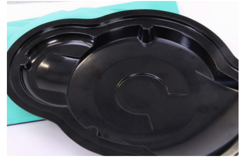
The cured mould has an excellent surface finish and is temperature stable up to 135°C.