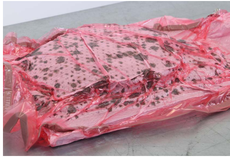
Once laminated, the part is vacuum bagged and cured in an oven at 65°C for its initial cure.