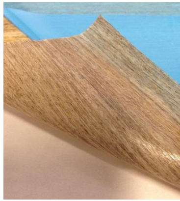
FlaxPreg T-UD material

FLAXPREG T-UD is a range of pre-impregnated materials based on epoxy resin and the 100% unidirectional flax fibres reinforcement developed by EcoTechnilin / Lineo : the FlaxTape™.