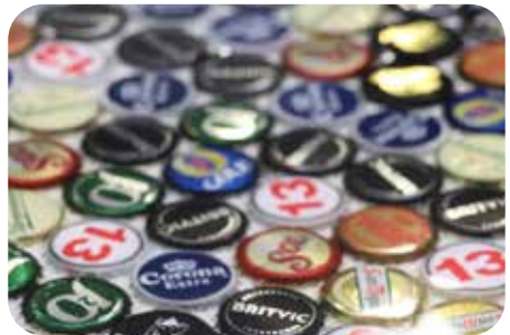
GlassCast® 3 poured over a Lego Technic Coffee Table and over a Bottle-top Bar-top.

For more information and lots of project ideas take a look at the Easy Composites product pages and Tutorials for in depth guides and case study projects.